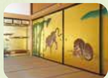
Entrance Hall (restored)