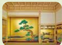
Main Hall (restored)

Hommaru Palace, burned down in WWII, was restored to its original state in 2018 thanks to photos and accurate plans from the past.